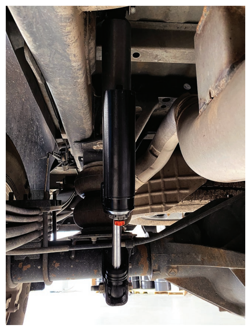
Figure 8: RAM 3500 passenger side shown