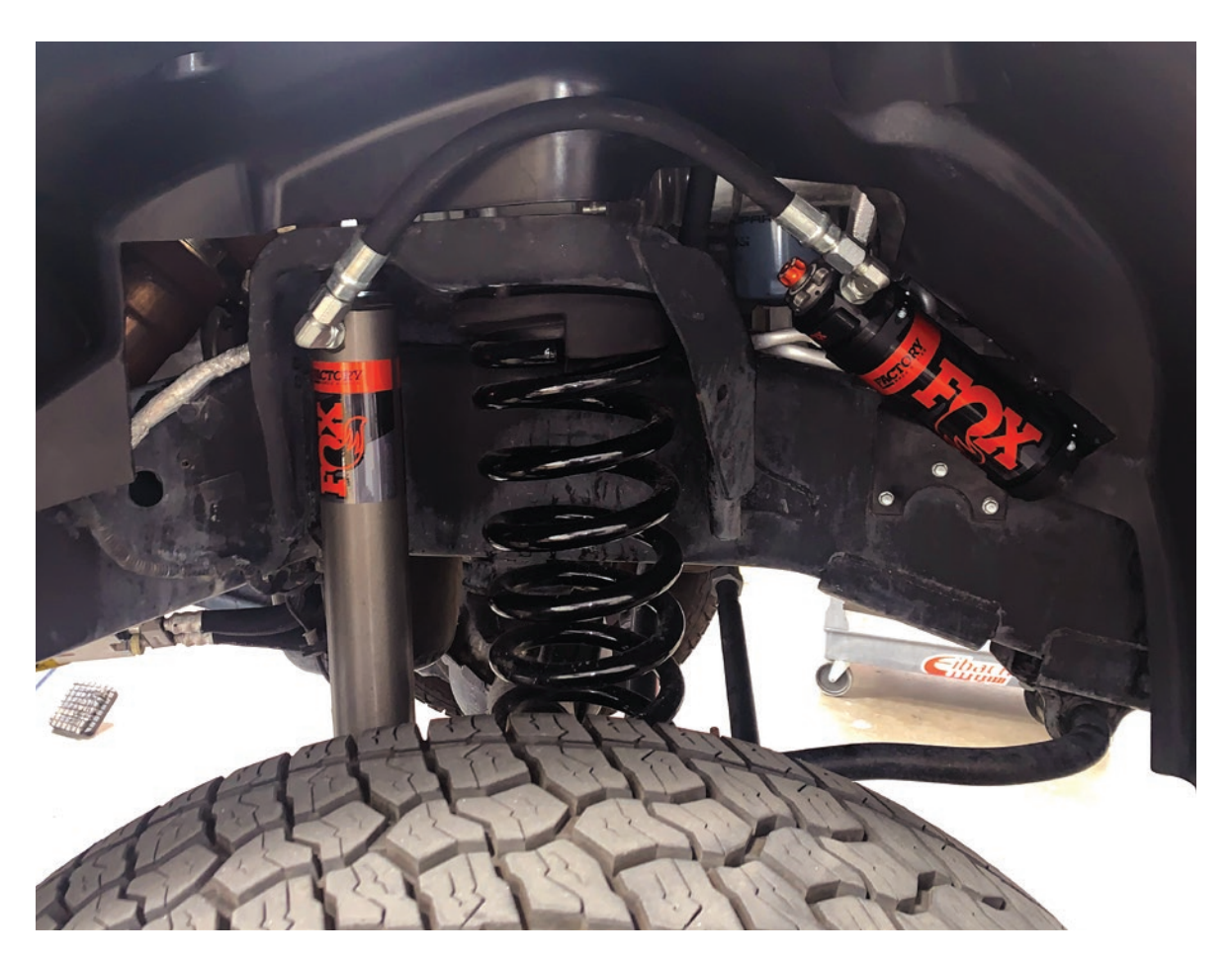
Figure 1: Passenger side shown