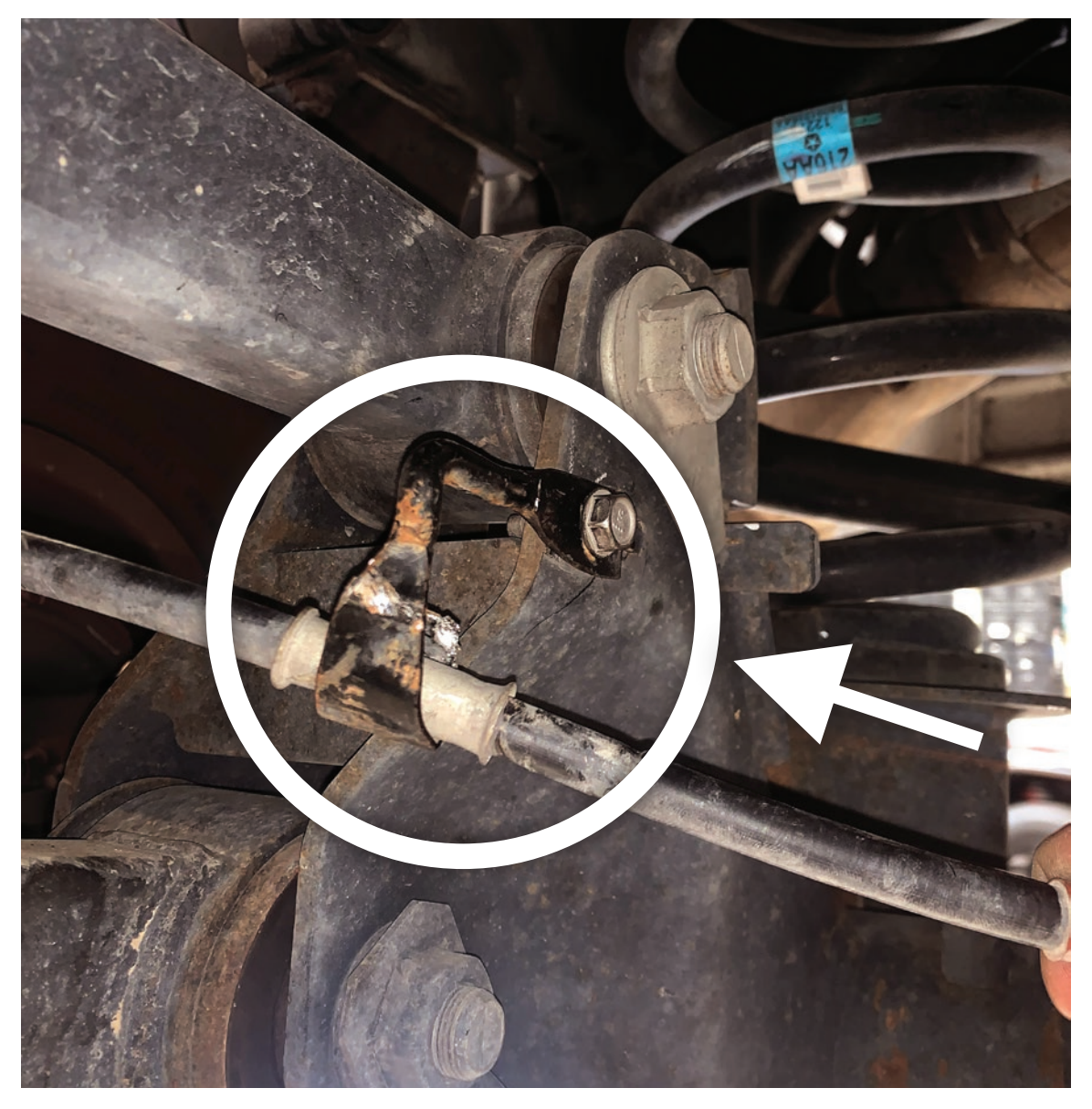
Figure 5: Passenger side shown