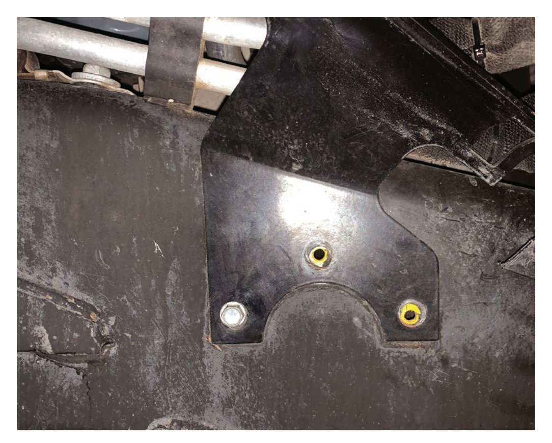
Figure 3: Passenger side shown