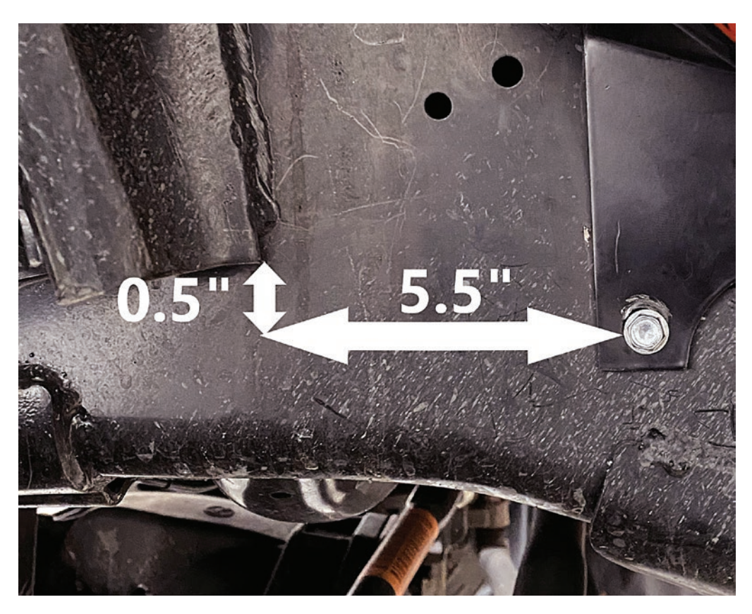
Figure 2: Passenger side shown