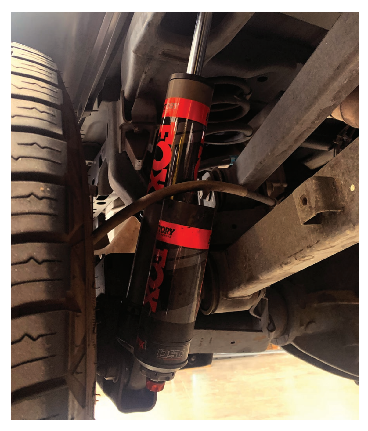
Figure 7: RAM 2500 passenger side shown

7. If applicable, tighten the bolt on top of the rear differential (Figure 6).